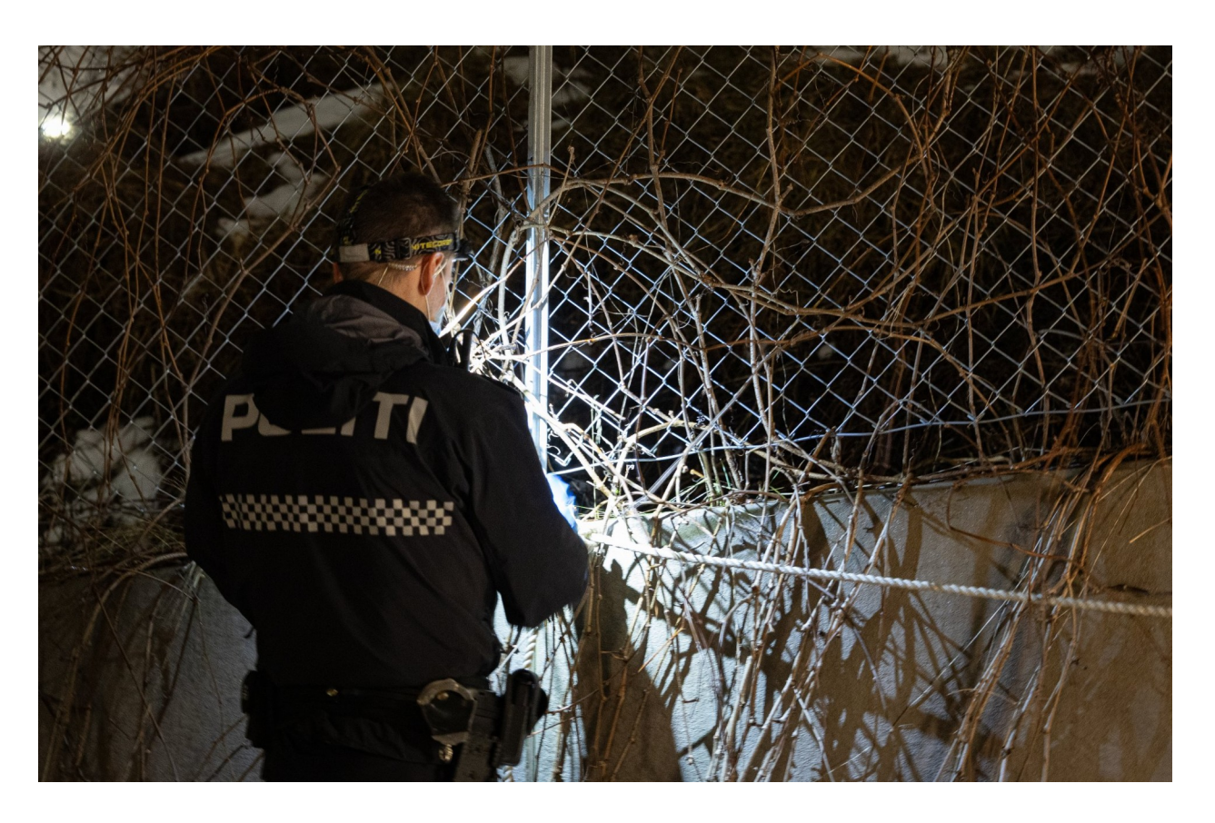
The police are securing evidence.